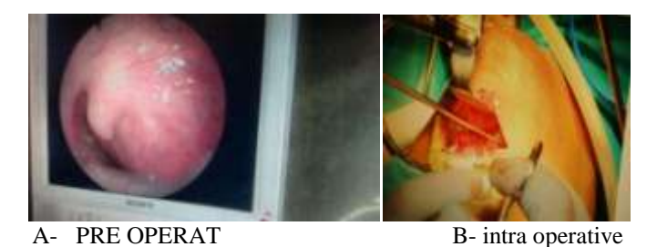
Case 3: A 56 year old female complaints of difficulty in swallowing and breathing since 3 months. On examination there is smooth bulge seen involving the right lateral wall of oropharynx. CECT showed moderate sized neoplastic mass in right parapharyngealspaceinprestyloid region. Transoralexcion was done histopathologically diagnosed as pleomorphic adenoma. No recurrence is seen.